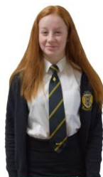
Trampolining Under 14 Elite - 1st